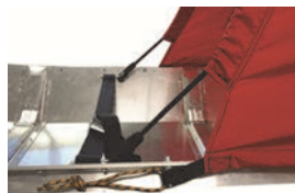
Raise and tighten the cover