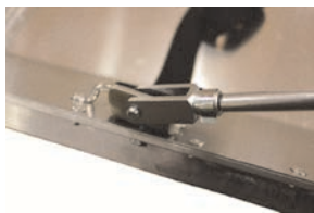
Fixation at Akja