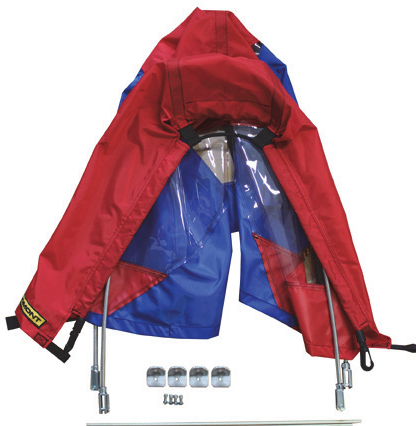
Provided parts „Windshield cover“

Roomy, foldable wind protection cover that provides effective protection for the injured in the Akja against airstream and whirled-up snow - especially, if the Akja is towed behind a snowmobile.