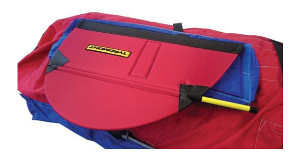
Mounted RBS on TYROMONT rescue bag with pump bag.