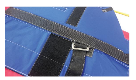
3. Pass the buckle through the slot.