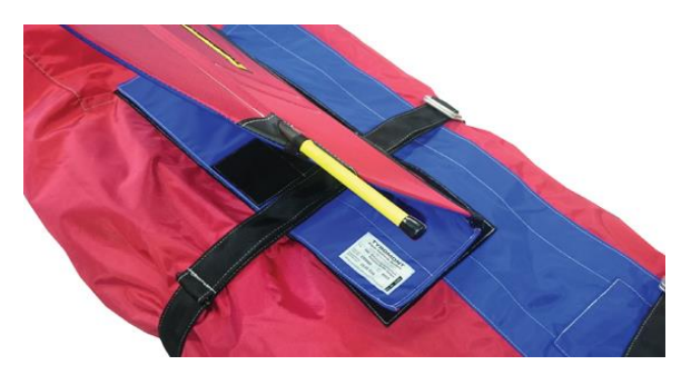
Mounted RBS on TYROMONT rescue bag without pump bag.