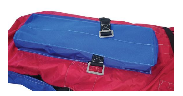
1. Fastening Velcro on top of the pump bag.