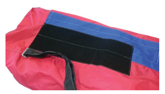
1. Fastening Velcro in the foot areas of the rescue bag.