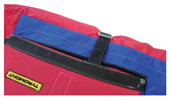
4. Close the fastening belt with the second part.