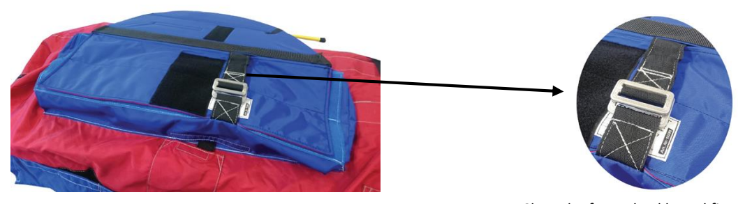
3. Pass the buckle through the slot.