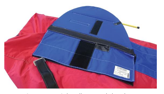
2. Put on RBS, handle towards head area.