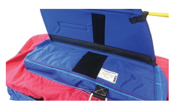
2. Put on RBS, handle towards head area.