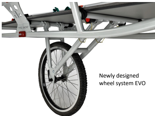
Newly designed wheel system EVO

Harness: 45mm colour-coded cross belts in the upper part of the body, one transverse strap in the pelvic and one in the leg area, each lockable with COBRA® polymer buckles.