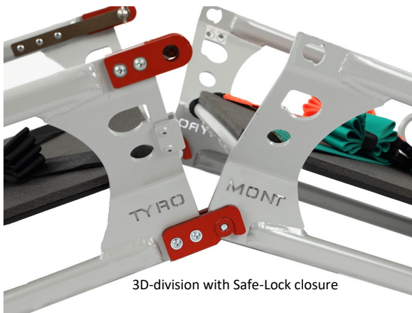
3D-division with Safe-Lock closure

The newly designed 3D-division in combination with the Safe-Lock closure makes it easy to assemble the two halves in any position as well as in the dark.